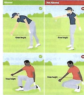
DIAGRAM 14.3b: DROPPING FROM KNEE HEIGHT

A ball must be dropped straight down from knee height. "Knee height" means the height of a player's knee when in a standing position. But the player does not have to be in a standing position when the ball is dropped.